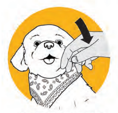
Pet the pup's left or right cheek and it will nuzzle your hand.

Your pup will respond differently depending on where you touch it.