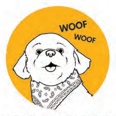
Talk to your pup to see it look toward you and hear it respond with puppy-like noises and BarkBack™ technology.