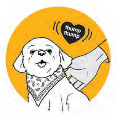
Slowly and gently pet your pup's back to experience a heartbeat sensation.