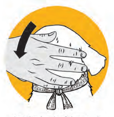
Pet the back of the pup's head and it will move.