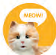
Cat-like movements & sounds