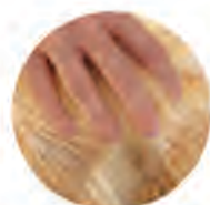
Soft fur inspired by real feline breeds