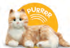
VibraPurr™ realistic cat purr